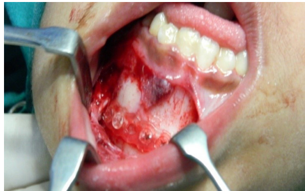
Fig 3: Open reduction and internal fixation of right parasymphysis fracture with resorbable plate and screws