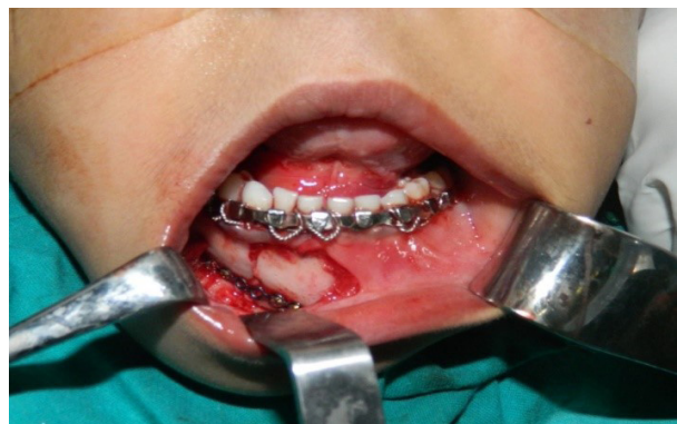
Fig 4: Open reduction and internal fixation of right parasymphysis fracture with titanium micro plate and screws