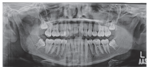
Figure 4: Post treatment (a) lateral cephalograph (b) orthopantomograph (5.11.2011)

Treatment alternatives discussed with patient were (1) Surgical removal of impacted tooth (2) Auto transplantation of impacted tooth once sufficient space is created with extraction of first premolars.